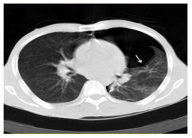
Figure 2. Chest CT scan uncovered a tension pneumothorax

Corresponding Author: Omid Sanaei Email: sanaei_o@yahoo.com