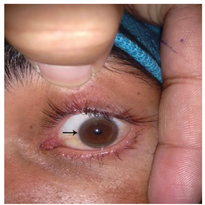
Figure 1. Kayser–Fleischer ring

His ultrasonography (USG) abdomen showed liver with coarse altered echo texture, portal vein diameter 10 mm at formation. Non-contrast computed tomography head showed hypodensity over bilateral white matter region. Findings on magnetic resonance imaging (MRI)