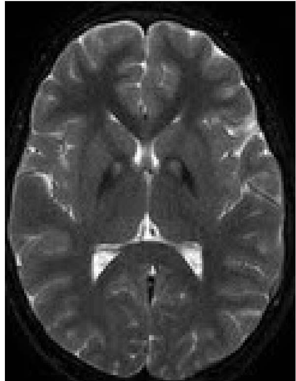
Figure 1. T2 weighted Brain magnetic resonance imaging of the patient I which shows a central hyperintensity within a surrounding area of hypointensity in globus pallidus (eye-of-the-tiger)

complained from stiffness in his hands and 2 years later dystonia appeared in his upper limbs. Oromandibular dystonia caused problems in feeding. On exam he had severe dysarthria, dystonia (more prominent in hands and oromandibular region), Babinski sign and tremor in hands.