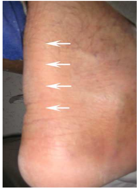
Figure 2. Bilateral enlargement of Achilles tendons (white arrows)

Finally, keep in mind to look at Achilles tendons of every patient with progressive neurologic deficit and early cataract.