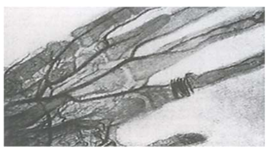
Figure 1. X-ray after Haschek and Lindenthal's injection of cadaver hand

Objects that were not opaque to X-rays could be visualized by agents that would render them opaque or contrast their outlines. Haschek and Lindenthal<sup>8</sup> injected the brachial artery of a cadaver with Teichmann's mixture, consisting of mercury as the contrast agent along with pumice to visualize the arteries of the hand in 1896 (Figure 1). The neurotoxic effects of mercury and the arterial obstruction that pumice injections would cause prohibited use of this mixture to outline the blood vessels of living animals.