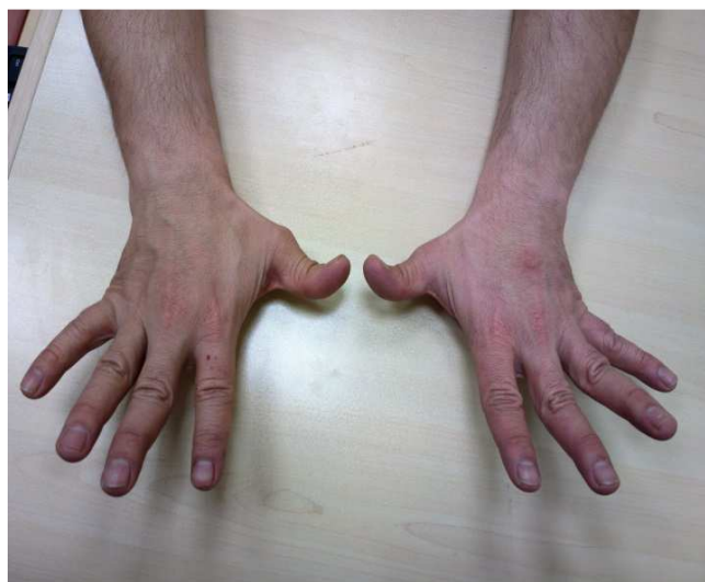
Figure 2. Hyperintense, ovoid-shaped, periventricular lesions located perpendicular to the ventricle

ECM is a structure that encloses and supports the cells. It has three major components. Structural proteins (mainly collagen), proteoglycan and hyaluronan, and specialized multi-adhesive proteins. ECM proteins were observed to involve in central nervous system inflammation and demyelination. 3 It is thought that in EDS, there are mutations in the