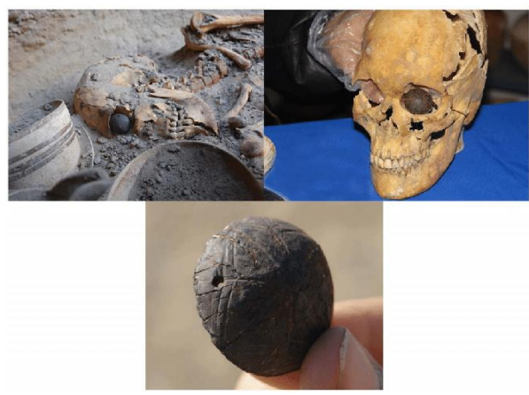
Figure 1. The earliest artificial eye found by Iranian archaeologists in Shahr-e-Sukhteh, Iran

13-year-old girl with congenital hydrocephalus, who underwent surgery for removing a part of her skull.<sup>32</sup> Based on the investigations, the patient lived for more than six months after the surgery.<sup>32</sup>