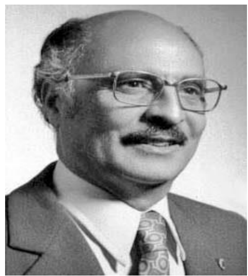
Figure 6. Professor Seyed Ebrahim Chehrazi, the father of modern neuropsychiatry in Iran

In 1929, Dr. Ebrahim Chehrazi (Figure 6),<sup>58</sup> "The father of modern neuropsychiatry in Iran", was chosen by the government for a scholarship to go to Paris to study medicine.