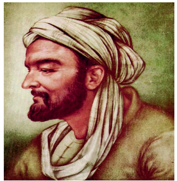
Figure 4. Ibn Sina (Avicenna) (980-1037 AD)

Finally, modern medicine started with the establishment of Dar al-Funun in 1851 for training physicians academically under the supervision of European and American teachers.<sup>43</sup> This was the first time the fields of medicine was separated, and the primary rules of each specialty were mainly derived from the European medical schools; some scholars completed their medical education in European countries.43 Given said that, all the achievements of Iranian physicians and scientists were separated as traditional medicine and considered as a subsidiary field. University of Tehran, Tehran, Iran, was the first modern university in Iran which was established in 1934 and considered as the mother university in Iran (Figure 5).44 The School of Medicine of Tehran University was established in 1934 which is still the most well-known center of medical education in Iran.44