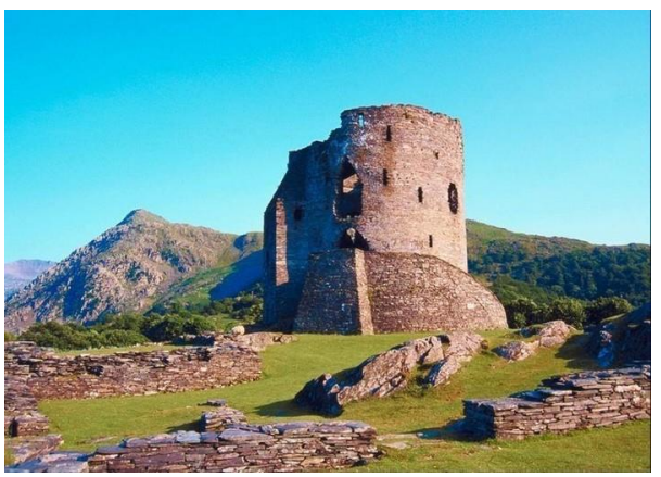
Figure 2. Ancient Gondishapur medical university, the most important medical center of the ancient world during the 6^{th} and 7^{th} centuries

By the introduction of Islam to Iran (651 AD), in the medieval period, there were significant improvements in hygiene observation methods.35 The Gondishapur medical center continued its activity until a few centuries later, training the first Muslim physician, Al-Harith ibn Kalada. However, after the conquest of Islam, the Zoroastrian healing methods (divine words) diminished and the destructed libraries of Gondishapur medical center was replaced with the Holy Koran.<sup>35</sup> After a few years, the medical center of the country was transferred to Baghdad, where the Greek, Iranian, and Indian scientists gathered to develop medicine based on the vast scientific works of outstanding Persian scientists (including Razi or Rhazes, Alpharabius, Jorjani, and Avicenna) to introduce their medical knowledge to the Islamic world.<sup>35</sup>