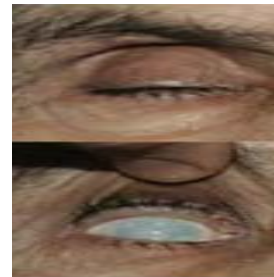
Figure 1. Left Blepharoptosis one week after botulinum toxin injection

botulinum toxin had been regularly injected for his symptom relief in orbicularis oculi, corrugator, and procerus muscles.