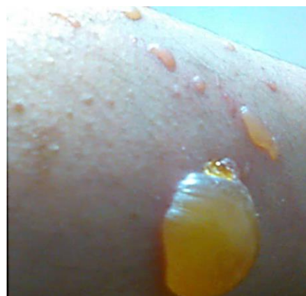
Figure 1. Large, fluid-filled blisters

dermatologist defined the lesions as fluid-filled and blistering at the site of injection without mucosal involvement (Figure 1).